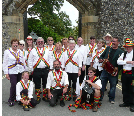
Some of the Rooster's outside Arundel Castle